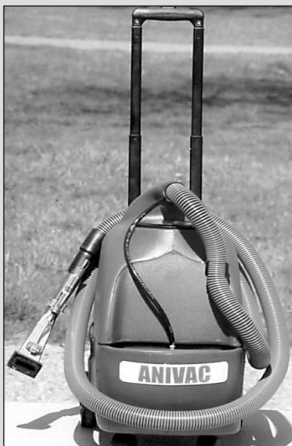
The Anivac cleaner is both a vacuum and an equine wash machine.

The machine is quiet, and if your horse is accustomed to a vacuum, he'll note little difference when you use the Anivac. It's easy to maneuver and simple to fill and empty. The wand fit nicely in our male and female testers' hands and was a snap to operate. The more quickly you're able to go, the less water that drips around the horse. With practice, you'll find the perfect cleaning speed.